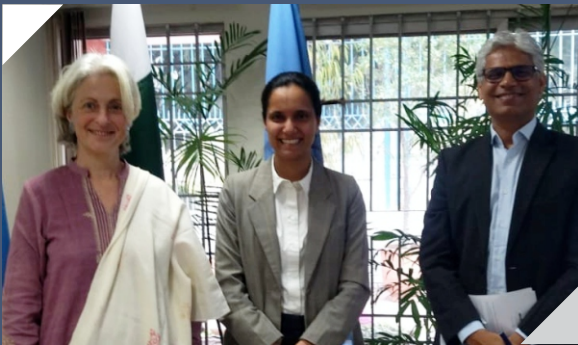
Meeting with Country Representative of FAO

Collaborative Endeavors Towards Progress!!