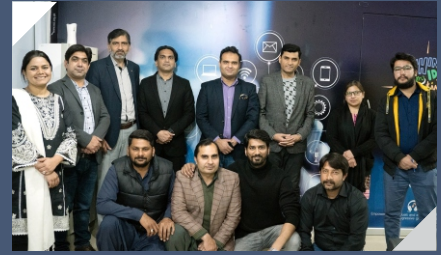
Session on Time and Team Management