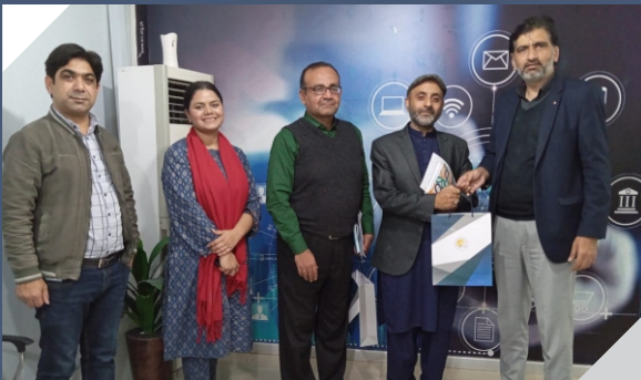
Meeting with Action Against Hunger