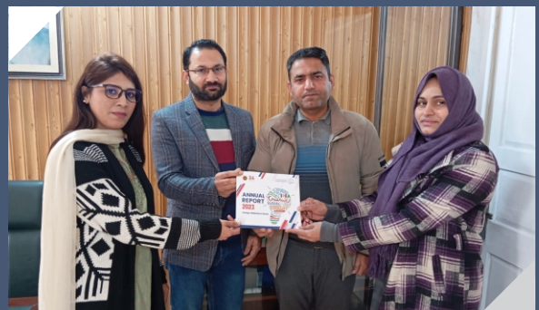
Meeting with TVETA Punjab