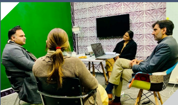
Meeting with Goal Organization