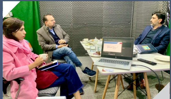
Meeting with Relief International