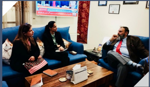
Meeting with Inspire Pakistan