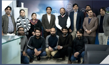
Session on Leadership impact