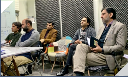
Session on Business Development and Communication